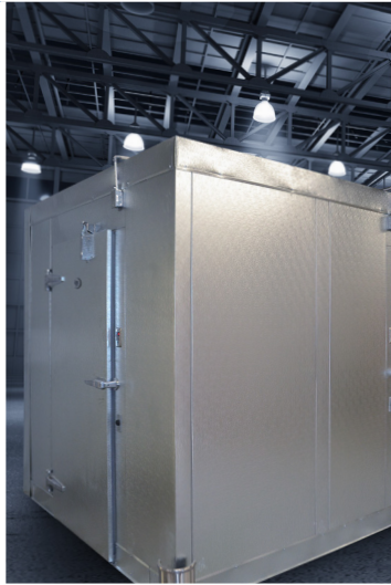
Backroom Solution For OGP