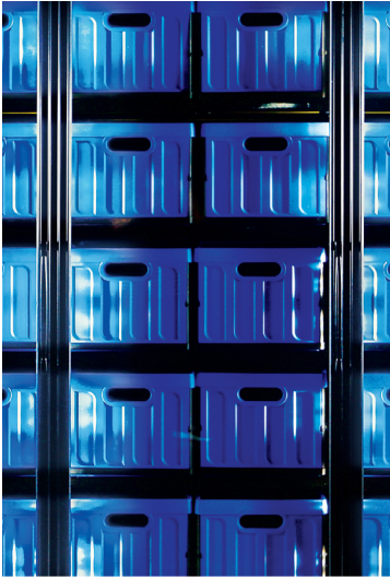
OGP BOX (Online Grocery Pickup Box)