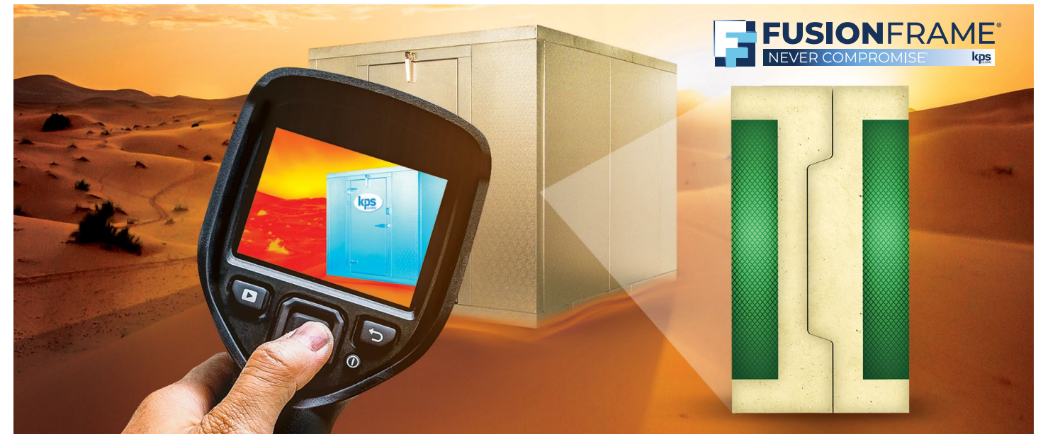
FUSION FRAME® from KPS Global, Inc., is a revolutionary new frame/rail system that combines a structural core comparable to wood and polyurethane foam in a method of construction that can be five times more efficient than traditional wood frames in keeping unwanted heat and humidity from entering walk-in storage units.

From the moment they are plugged in, turned on and begin the task of reaching and maintaining a predetermined interior temperature, walk-in coolers and freezers are locked in a never-ending battle against physics. Namely, it is a war to keep the warmer exterior air and humidity that are constantly assaulting them from entering the interior, where they can compromise the walk-in unit's cooling and freezing capabilities, cause excess refrigeration runtime leading to the creation of condensation and ice that damage the products contained within, and create slip-and-fall hazards.